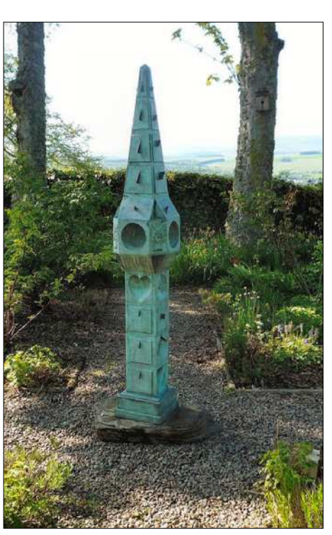
Fig. 1. Kinkell obelisk.

He also produced a huge 37ft high market cross in 2001 which stands in Falcon Square in the centre of Inverness (SRN 7098, Fig. 3). It was unveiled by Prince Andrew and is a popular meeting place for people, young and old. It is made from the finest Clashach sandstone and is topped by a bronze Scottish unicorn. Four bronze flying peregrine falcons (sculpted by Leonie Gibbs) said to be in various stages of attack on a pigeon, are positioned around the upper reaches of the obelisk.