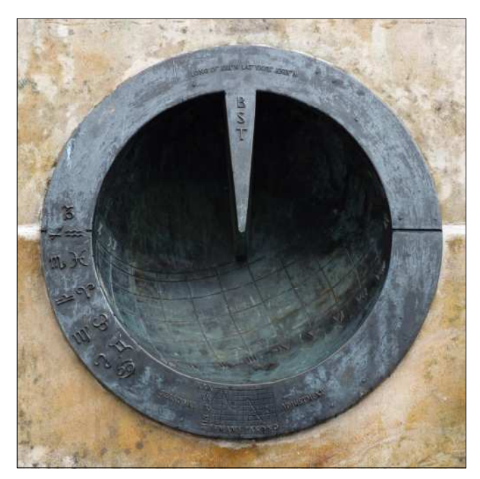
Fig. 4. The West? scaphe dial at Inverness.

lows in cast bronze mounted at eye level on the east, south and west faces. The south dial has a 150 mm pin gnomon whilst the east and west dials each have a peripheral notch. The south dial, like the market cross at Inverness, has a graphical representation of the equation of time. The dials include hour lines, equinox and tropic lines. The gnomonics are by George Higgs.