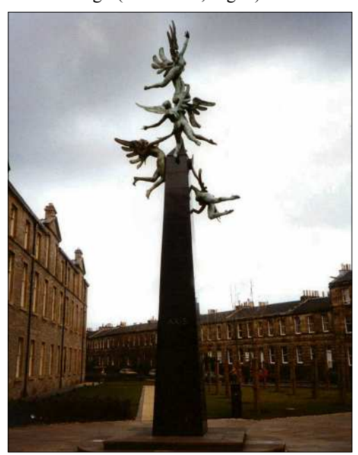
Fig. 5. 'Axis Mundi' at Canonmills, Edinburgh.

In 1991 he produced 'Axis Mundi', a six metre high obelisk of polished black granite surmounted by the five wise virgins in bronze for Standard Life's offices in Canonmills in Edinburgh (SRN 2074, Fig. 5). It includes three cup hol-