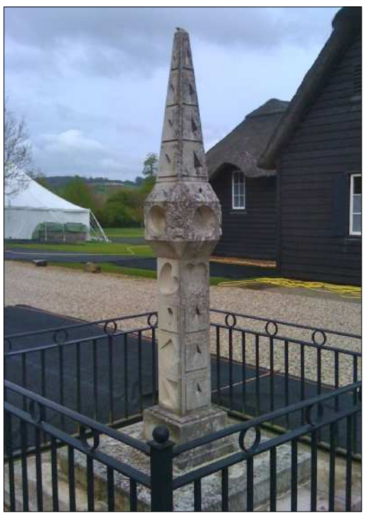
Fig. 2. Wormsley Cricket Ground.