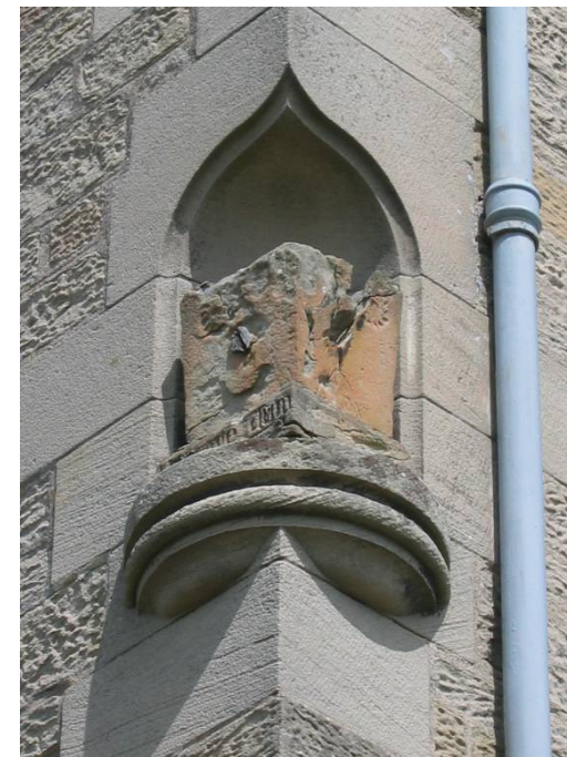
Chirnside Church sundial

badly eroded two faced cube sundial is set in an ogee arched niche in the south-west corner of this church. It was originally mounted on a skewput, but would have been moved to its present position in the early 20 th century when the tower was added. The sundial is dated 1816, but it is thought to be much earlier. Neither the date nor the motto of "Hoc age dum Lumen adest" is now readable. It has Roman numerals but the hour lines are no longer visible. The gnomons are missing, apart from stubs, but would have emerged from sun like motifs.