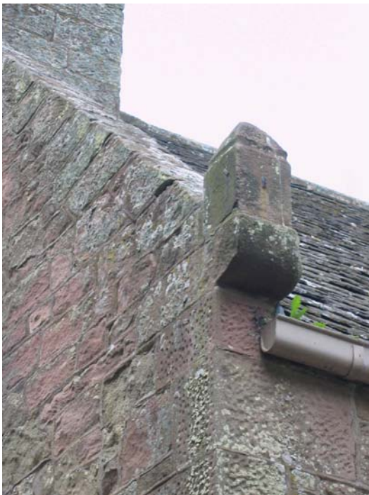
Swinton Church sundial

has an inscription which reads “While the earth remaineth, seed time and harvest shall not cease.”