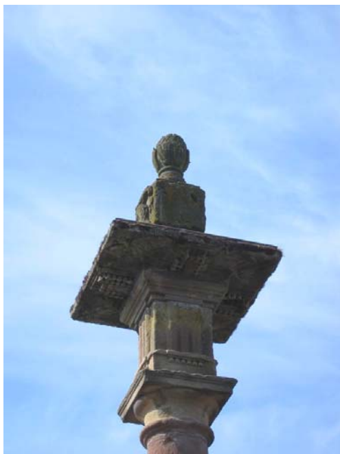
Duns Mercat Cross

The Mercat Cross was first erected in 1792 and removed in 1816 from Market Square to make way for the new Town Hall. It was erected in a public park, but was returned to its rightful place opposite Market Square in 1993.