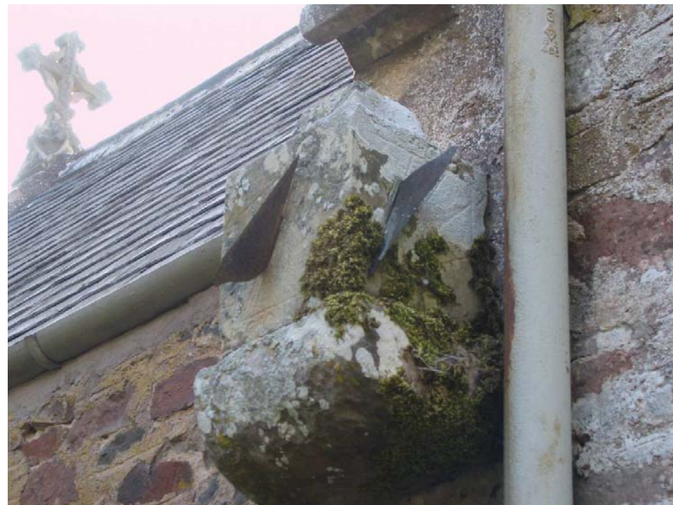
Longformacus Church sundial