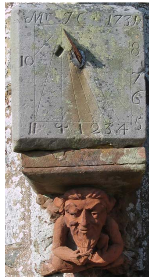
The central face of the Cranshaws Church sundial

However, as an alternative, continue on the B6355 from Cranshaws north-west to Gifford, where you should take the B6369 towards Haddington and eventually to the A1.