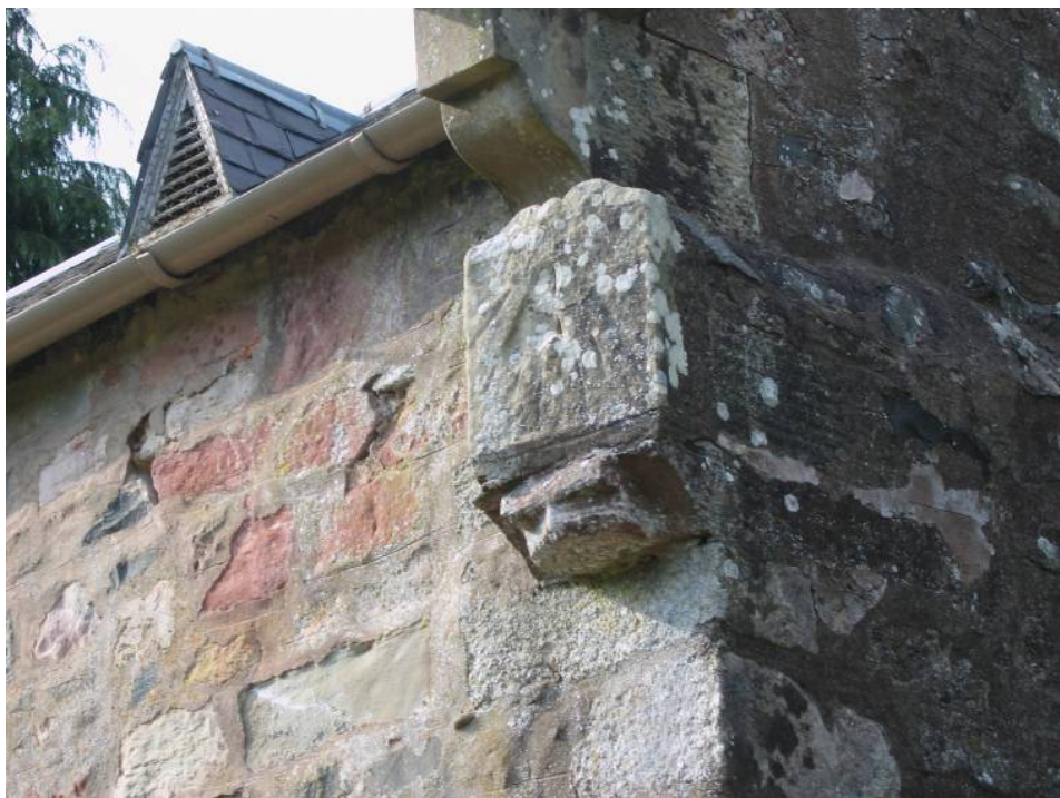
Abbey St Bathans Church sundial

No 9 on Map - A three faced stone cube dial in reasonable condition is situated