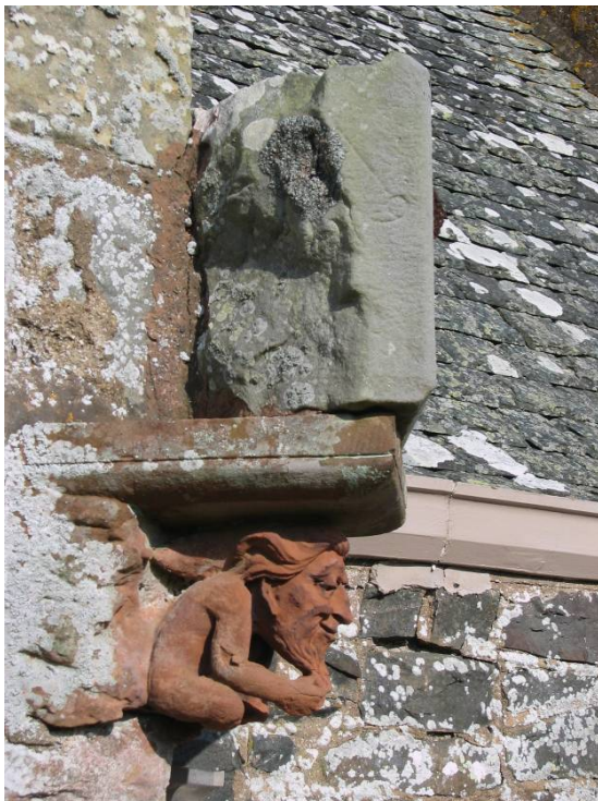
The left hand face of the Cranshaws Church sundial

Turn round and drive back along the single track road to the B6355 and the red telephone box, and turn left. Cranshaws Church will be seen across the fields in about four miles on your right.