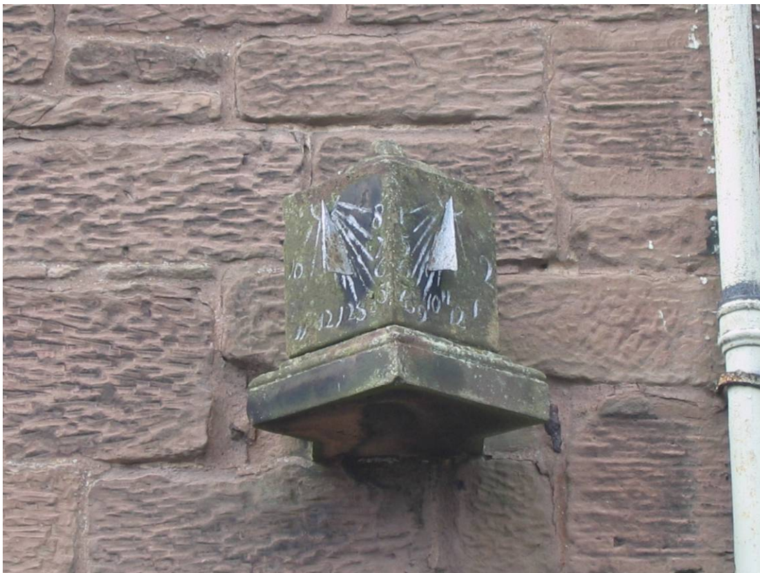
Sundial at 43 Main St. Swinton

No 5 on Map – You will see a cube with two dial faces on the front of the house. The east facing dial has hour lines for 4am to 2pm whilst the south facing dial has 10am to 8pm. Both the hour lines and numerals have been crudely painted over in white. Both solid metal gnomons are intact.