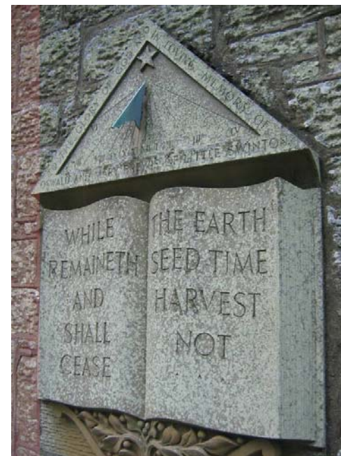
Swinton Church sundial

No 6 on Map – There are two sundials on this church at Swinton which was built in 1729 on the site of the old church.