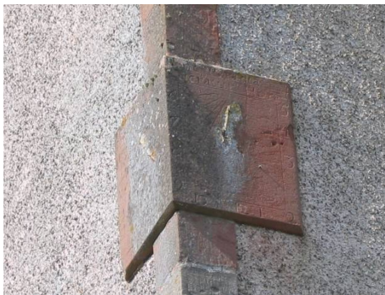
Polwarth Church sundial

No 2 on Map – Polwarth Church is a fine building and the two faced stone sundial will be seen high on the south-west corner of the tower. The gnomons have not survived, but little stubs remain in place. The south facing dial has Arabic numerals from 6am to 5pm.