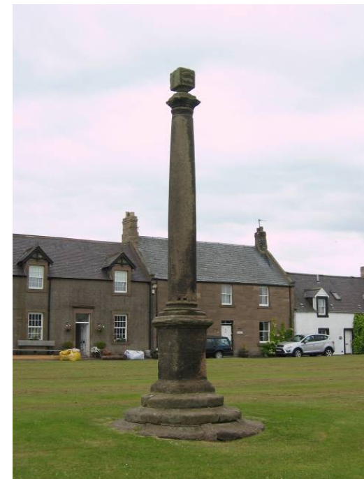
Swinton Mercat Cross

No 4 on Map – On the Green you will see Swinton’s Mercat Cross on the top of which is a cube dial. There are dial faces on the south, east and west faces whilst the north face has Swinton’s coat of arms comprising of two boars.