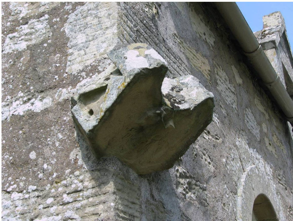
Inclining sundial at Fogo Church

of Scotland” as “remarkable”. However he was not aware of this example at Fogo. It is situated adjacent to the external staircase on the original south west corner of the church. It is a badly eroded semi cylindrical inclining dial with a triangular dial on its west face, and possibly dates from around 1570. There are no visible markings.