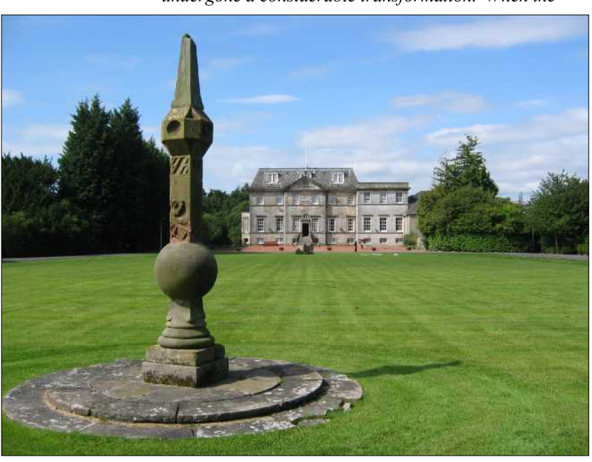
Fig.2 (right). The obelisk dial now.