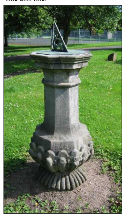
Figs 4 & 5. The horizontal sundial with the dial by John England.

It was probably made in the late 17<sup>th</sup> century, but it is unique since its modification in the 18<sup>th</sup> century by the addition of the globe base. Obelisk sundials are few and far between, only twenty-six known complete examples exist in Scotland, and there are no other obelisk sundials quite like this one.