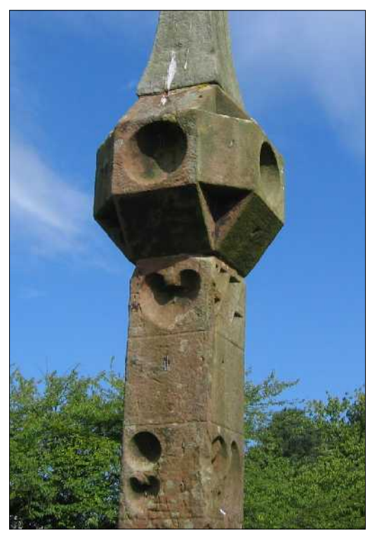
Fig. 3. Detail of the obelisk.

As to its current condition, it appears to be still much the same as Ross saw it some 120 years ago. The only noticeable differences to me are that the lines on the globe are hardly legible now, but Ross may have enhanced them in his sketch, and the red sandstone parts may now be more worn. As in Ross's day, there are no gnomons remaining, but I counted stubs of some twenty-four, plus numerous cup hollows and geometric sinkings (Fig. 3), all of which functioned as sundials.