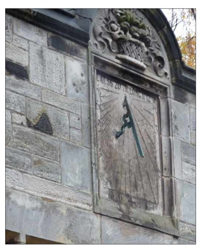
Fig. 1. The dial on University Hall, St Andrews.

first realised that there may be a problem with the longitude marked on some Scottish sundials after I entered the Sundial Trail competition in 2010 sponsored jointly by 'Sundials on the Internet' and the BSS, with my entry entitled "Sundial Trails to the Home of Golf". This trail was actually three trails in one – one trail to St Andrews (East Neuk) and another from St Andrews (North Fife), as well as a trail in St Andrews itself.