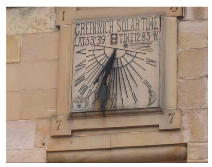
Fig. 5. The dial in Peebles High Street.

The first was at the National Trust for Scotland house near Cupar in Fife (Fig. 4). The Hill of Tarvit Mansionhouse was designed in 1906 by Sir Robert Lorimer for the Sharp family who had made their money from the jute industry, and it included a rather magnificent huge vertical sundial on the south face of the house. This dial showed a latitude of 56° 18′ and a longitude of 12<sup>min</sup> West. Lorimar was also a