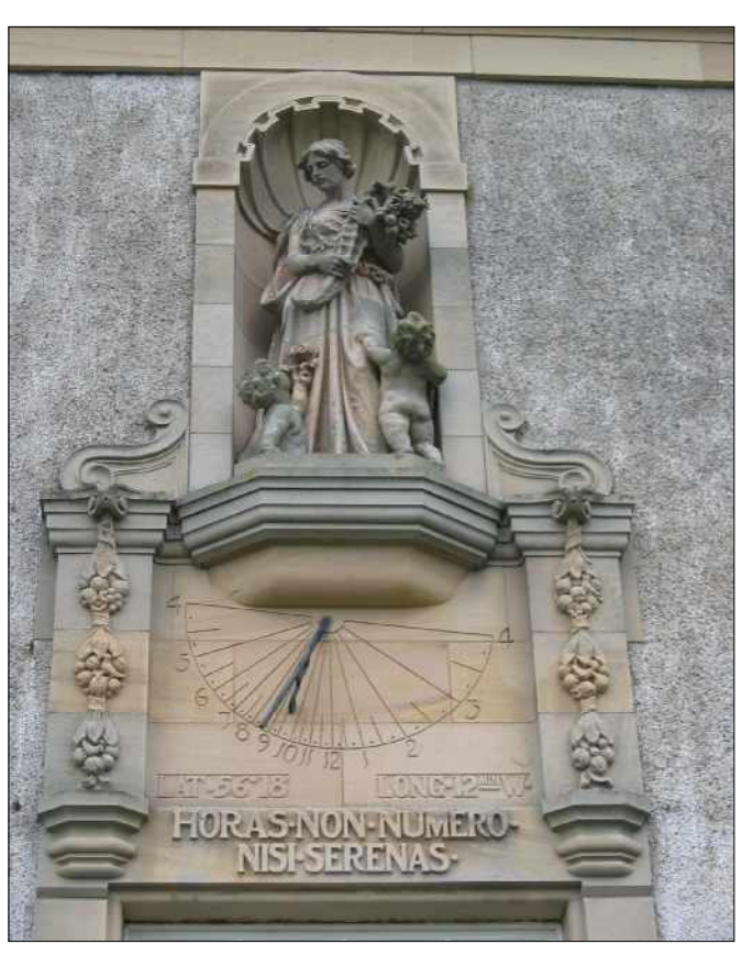
Fig. 4. The Hill of Tarvit Mansionhouse dial.

Some years ago I had photographed two other sundials with apparent anomalies in the longitude inscribed upon them, but had not picked up on it.