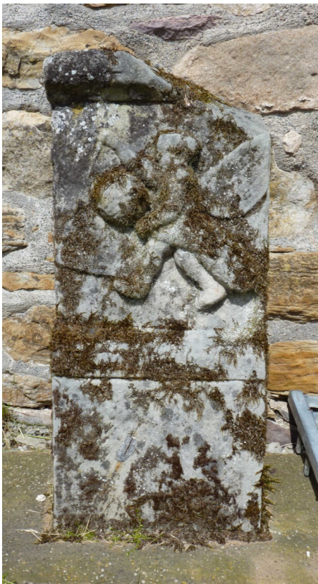
Fig. 6. The topmost dial with the figure of Death above.