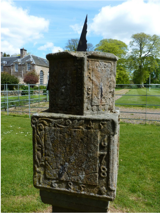
Fig. 5. The north-east face showing the date of 1685.

the dial in its new location, it is set to the south-west rather than north!