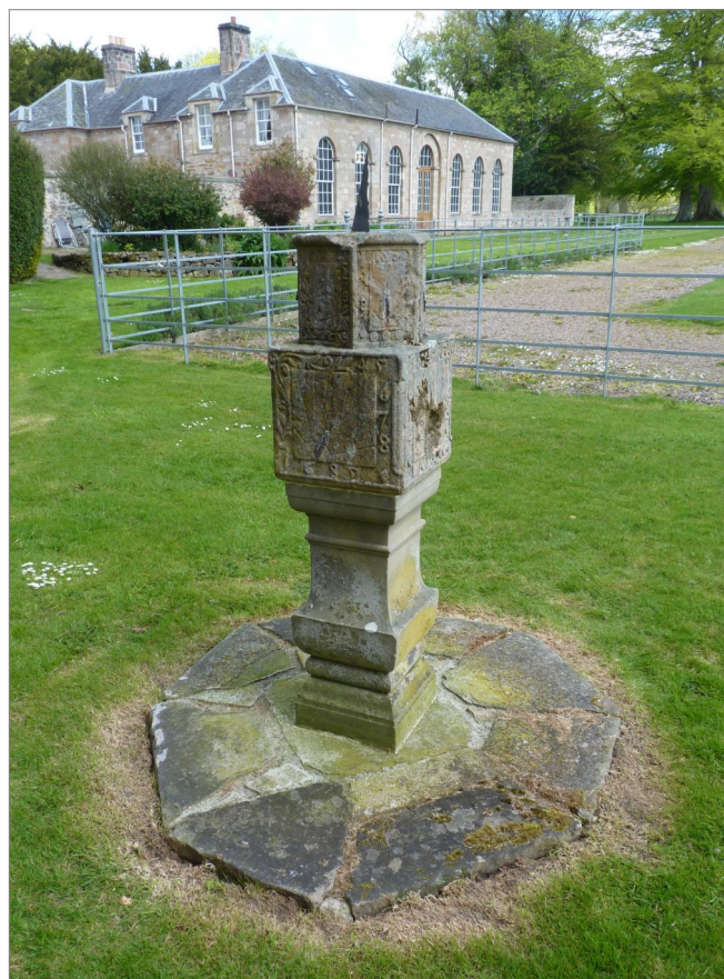
Fig. 3. The dials today on their newer column.

A couple of weeks later, my wife and I visited Arniston (Fig. 2), and as soon as we entered the private garden I could see that this almost certainly was the missing Polton House dial. There were changes, the lowest (and largest) dial was missing, but the two tiers of dials above as described by Ross were there, albeit now mounted on a newer column (Fig. 3), with the uppermost having gained a horizontal dial on top. Actually on closer inspection, it was only decorative. A gnomon was in place but there were no