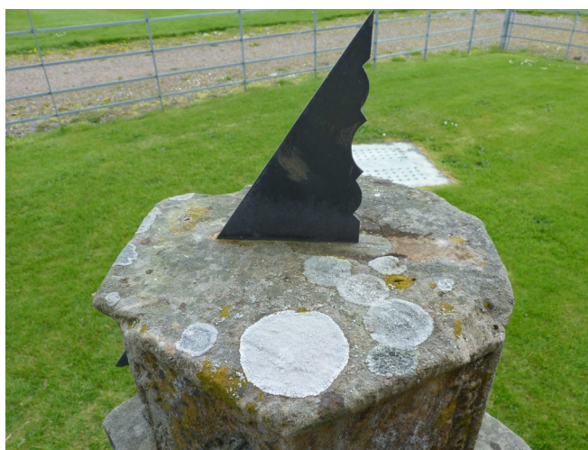
Fig. 4. The horizontal surface with the added gnomon.

Unfortunately, although the new gnomon on the horizontal surface is set correctly with respects to the rest of the dial, and despite the assistance of Historic Scotland in setting up