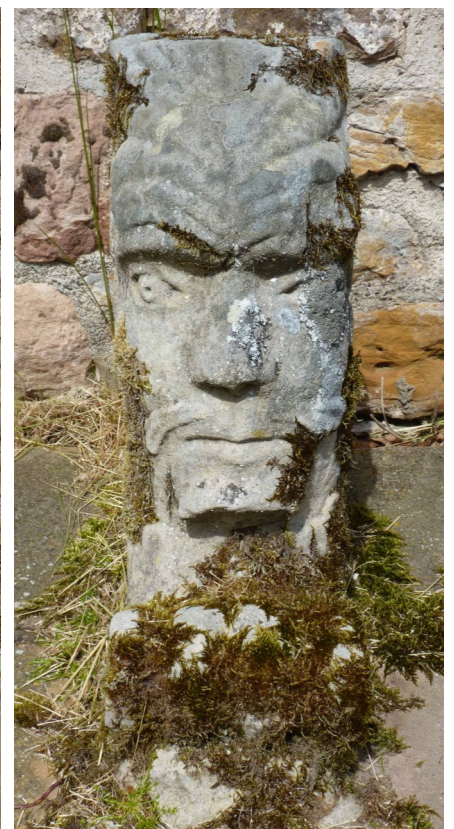
Figs 7 and 8. The 'stones'.