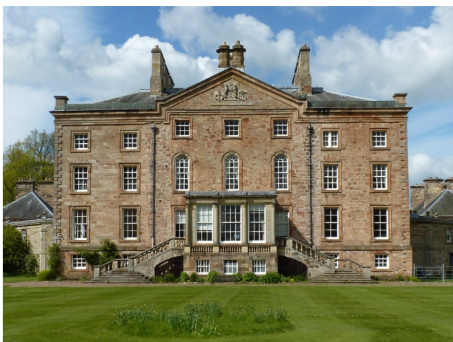
Fig. 2. Arniston House.