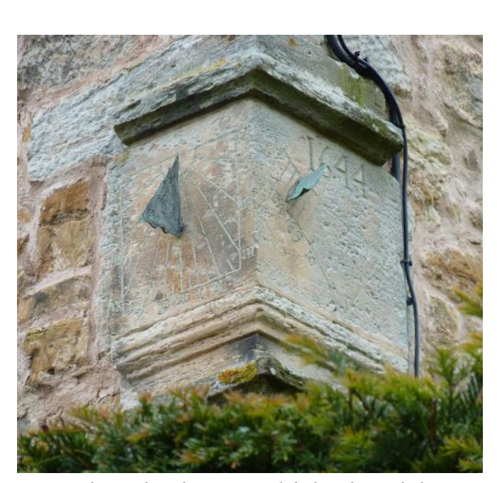
Fig. 5. The south and east vertical dials today with the probably re-engraved date.