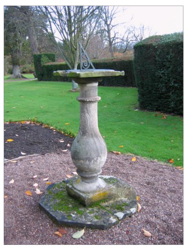
Fig. 2. The horizontal dial and pedestal.

As can be read above, Ross identifies it as a "round horizontal dial" but as can be seen from Fig. 3, it is clearly octagonal. It is almost certainly the same dial, however, as although the markings are only just legible today, the