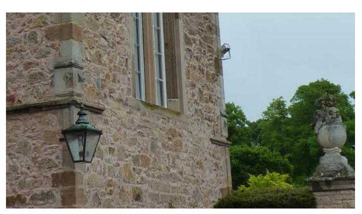
Fig. 9. The south-east and south-west dials together.

Finally, Fig. 9 shows the close proximity of these last two dials.