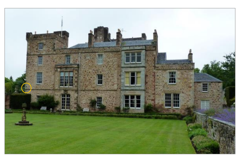
Fig. 6. Lennoxlove with the Lady in the left foreground and the south and east vertical dials (circled) above her and underneath the security camera.

This dial is on the left-hand edge of the building underneath the security camera and directly above the Lady in the left foreground of Fig. 6.