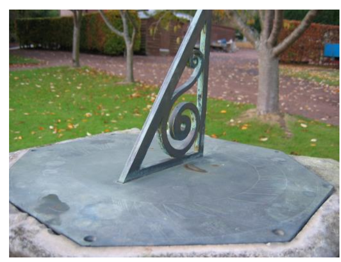
Fig. 3. Detail of the horizontal dial.

engraving described by Ross can be seen. There are Roman numerals from 4 am to 8 pm read from the inside on an inner ring. Outside that another ring includes hour, halfand quarter-hour lines, outside of which is a minute scale with ten minute intervals named. Additionally, "for latitude 56 degrees" can be identified on the dial, which is correct