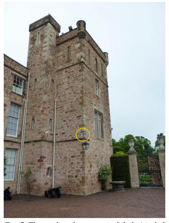
Fig. 7. The south and west vertical dials (circled) above the lamp on the corner of the house.