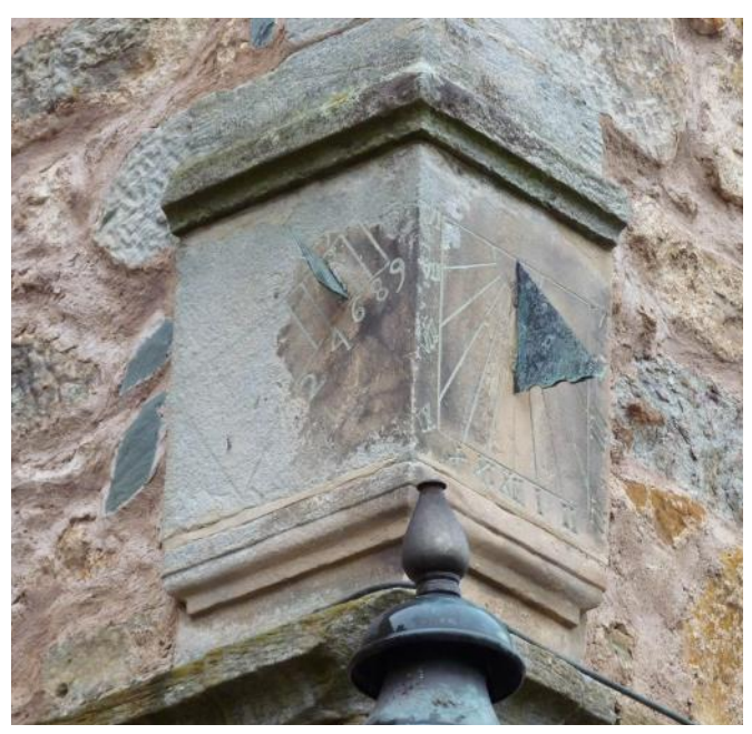
Fig. 8. Detail of the south and west vertical dials.

There is another dial at Lennoxlove which was not known to Ross. It is similar in design to the previous dial, but has south- and west-facing dials sitting as it does on the southwest corner of the house above the lamp (Fig. 7). Again like the south-east dial, the south face has Roman numerals whilst the west face has Arabic numerals (Fig. 8).