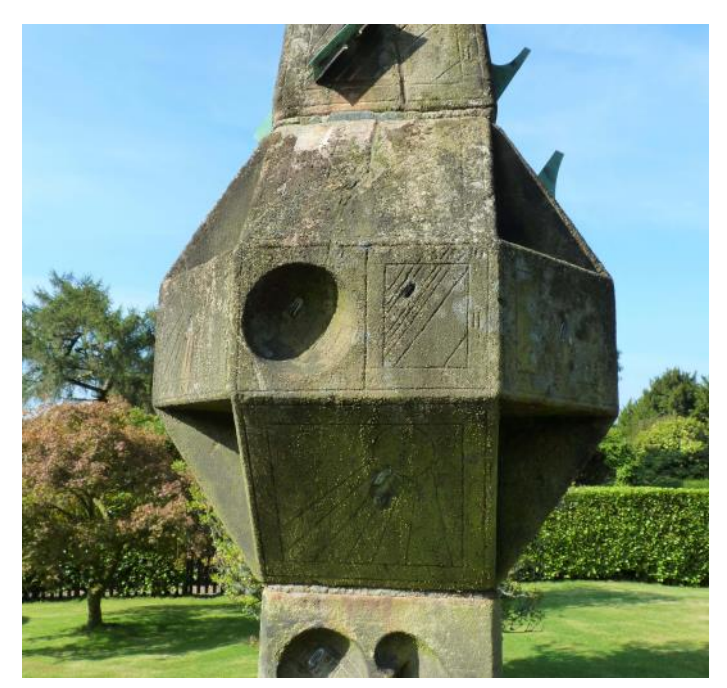
Fig. 6. Close up of the capital's east face.

many cup hollows and heart and geometric sinkings as well as reclining and proclining dials. A close up of the east face of the obelisk capital is shown at Fig. 6.