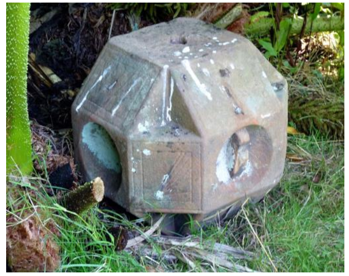
Fig. 9. The capital lying in the undergrowth.

Looking at Fig. 8 and Somerville's photograph from 1978 (Fig. 10) which were both taken from approximately the same position, the surrounding vegetation seems to have changed somewhat! The obelisk though looked to be the same in 1978 as it had in Ross's day.