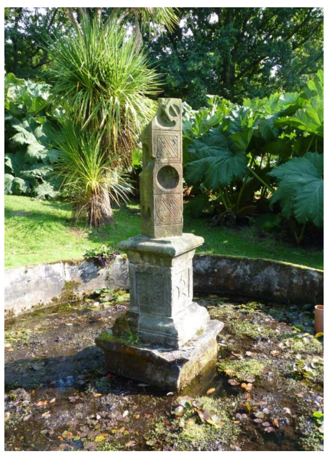
Fig. 8. The broken obelisk today.

Unfortunately, this dial has not fared very well. It still stands in the same stone basin that it did when Ross saw it, but the water is very low in the basin and does not appear to be running. Worse than that, the capital and finial have broken off from the shaft (Fig. 8). After a bit of rummaging around, the capital was found to be lying in the undergrowth nearby (Fig. 9). The finial and ball were also lying nearby although they were in many pieces. As Ross says, however, they were probably not original and had no dials on them.