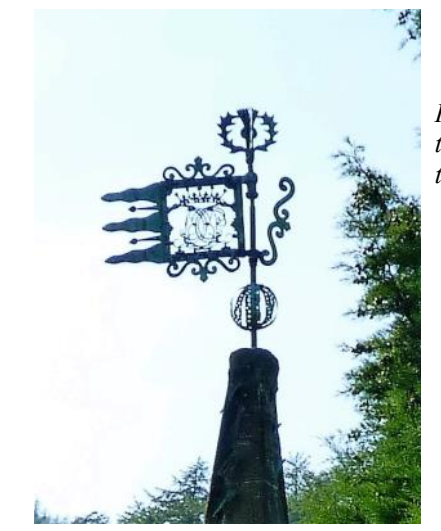
Fig. 4. The vane on top of the finial today.

Fig. 5. The first obelisk today viewed from the south-east.