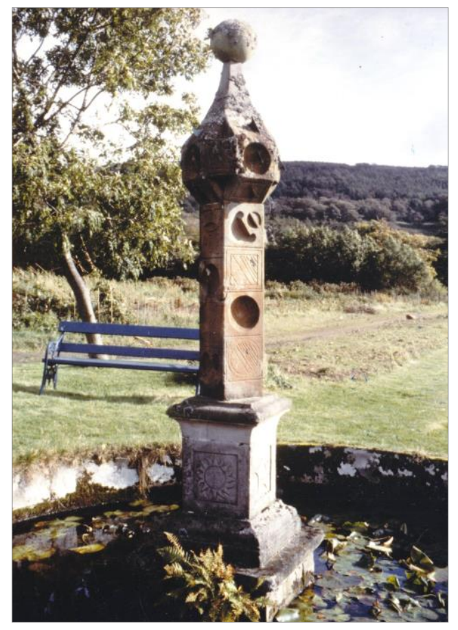
Fig. 10. The second obelisk in 1978.

But what about the castle's graffiti paint job? The castle is a category A listed building, so planning permission had to be obtained to allow the work to be carried out. In 2007, Historic Scotland agreed to the project and planning permission was then approved on the basis that the graffiti