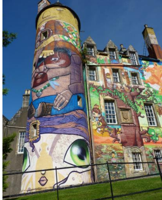
Figs 1 and 2. Kelburn Castle and its Brazilian graffiti paint job.

underneath and would have to be removed. But before that had to happen, the current Earl's children had the idea to give the harling a paint job. The Earl decided to bring in four graffiti artists from Brazil to carry out the work. As can be seen from Figs 1 and 2, the result was a little out of the ordinary!